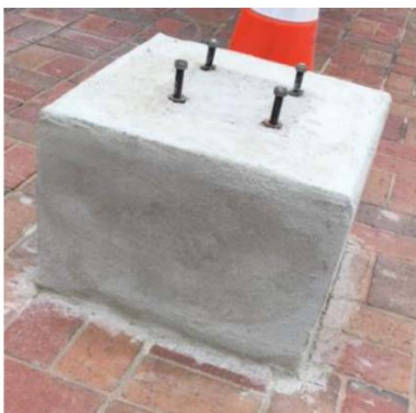
Each concrete pedestal is reinforced with rebar. They are 18" wide by 18" deep by 12" high.