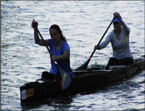
Colorado 100 Canoe Race @ Riverbend Park