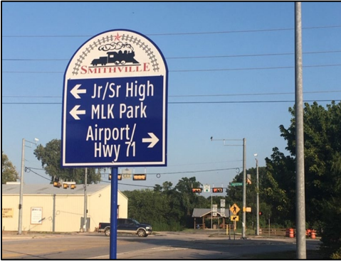
New Wayfinding Signs Installed