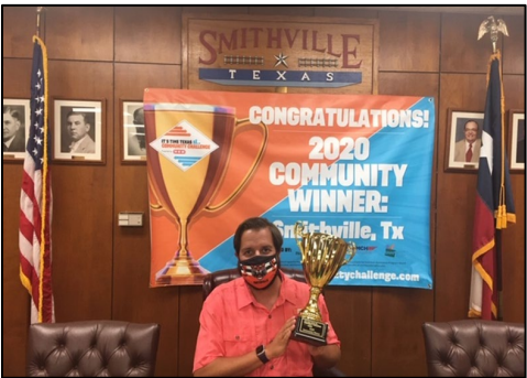
2020 HEB It's Time Texas Community Award Winner