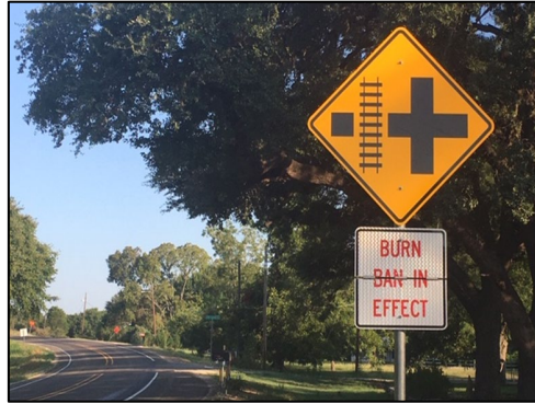
BURN BAN in Effect