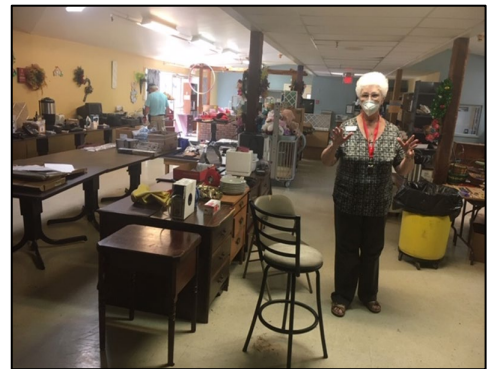
SWHP Estate Sale @ the Old Towers