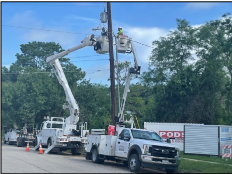
Electric Crew Repairing Service