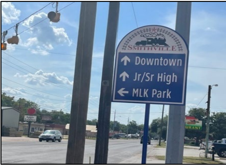
New Wayfinding Signs Installed