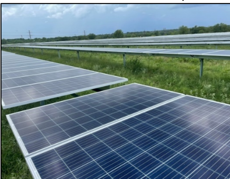
Smithville Solar One Solar Array