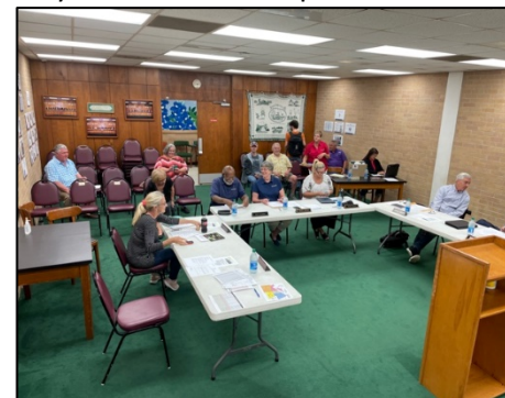
City Council Workshop