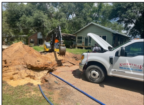
Miscellaneous Drainage Improvement Projects (Whitehead and Loop 230 / 7 th Street Detention Pond / NE 1 st Street)