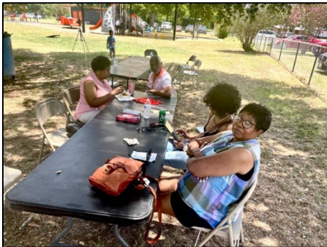
Juneteenth Celebration @ MLK Park