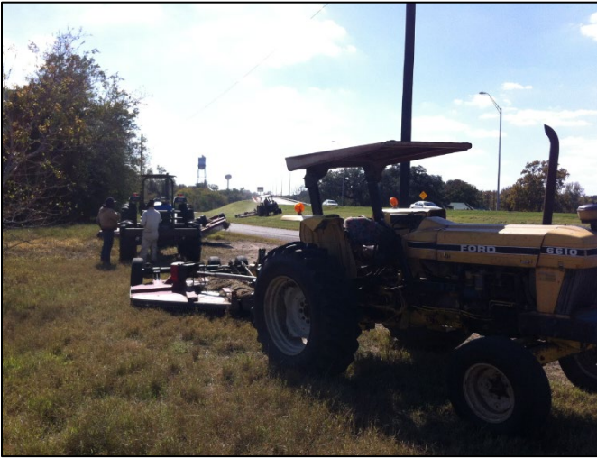
TXDOT Mowing on Loop 230