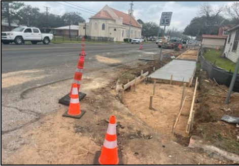
Sidewalk Construction on North side of Loop 230