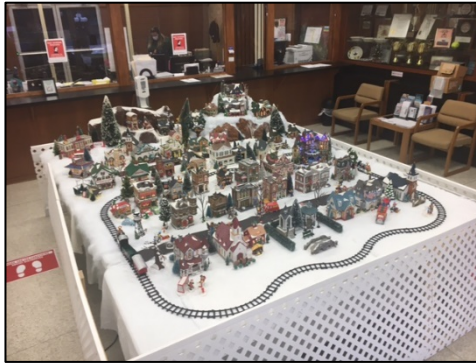
XMAS Village @ City Hall