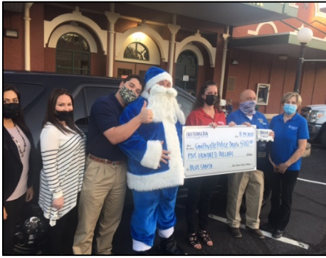
Blue Santa 2020