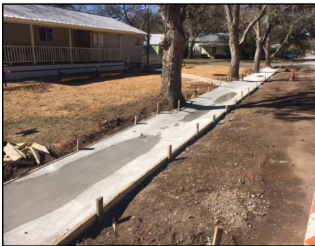
Drainage Project on NE 2 nd & Mills