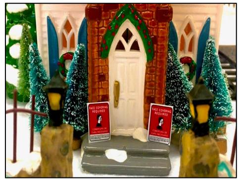
Mini "Face Mask Required" Signs