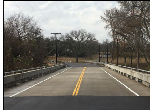
4 th Avenue Bridge Striping