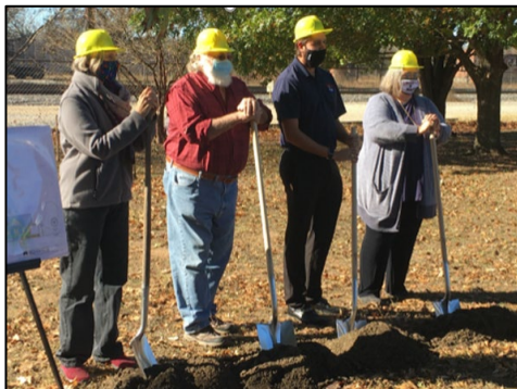
Chamber Building Groundbreaking