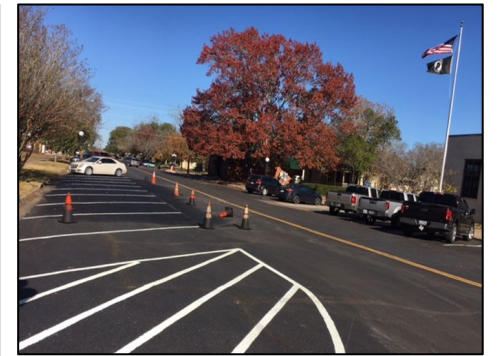
Main Street Parking Space Striping