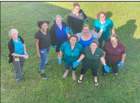
City Hall Staff on the DDT