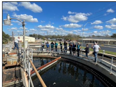
Gazley WWT Clarifier