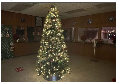
City Hall Christmas Decorations