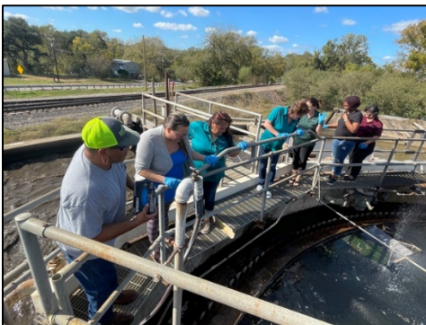
Gazley WWT Plant Tour