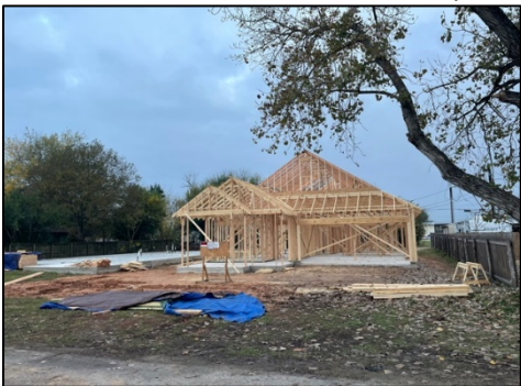
New Construction – 205 McSweeney St