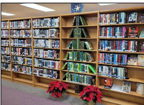
SPL XMAS Decorations