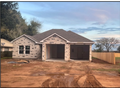
1423 NE 8 th Street @ Faulkner Road