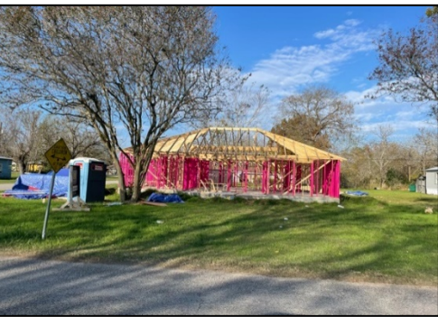
New Construction - 406 Jones Street