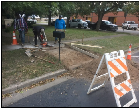
Sidewalk Repair on Main St