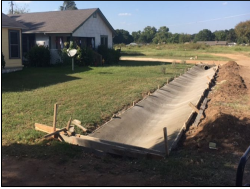
Small Drainage Project on Webb St